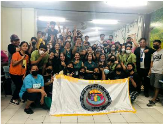
Phil. Statistics Authority Multi-Purpose Cooperative