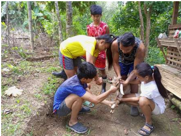
5th Batch of our 3-Month Vocational Farm Training