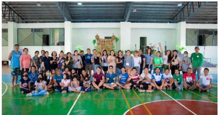
OFI and OBFI Staff in one frame