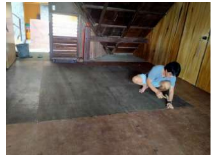
Big house flooring repairs