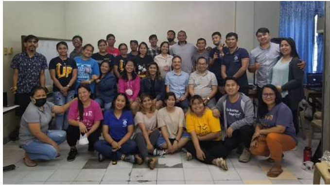
Our International Coordinator together with Onesimo staff