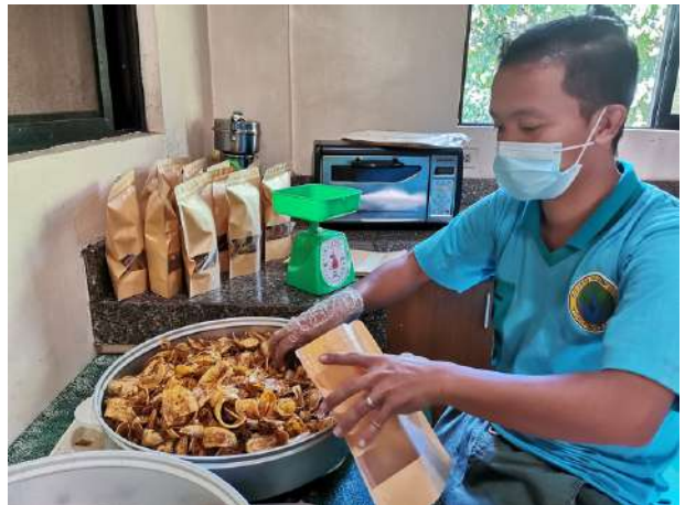
New By-Products: Banana Chips fresh from the Farm